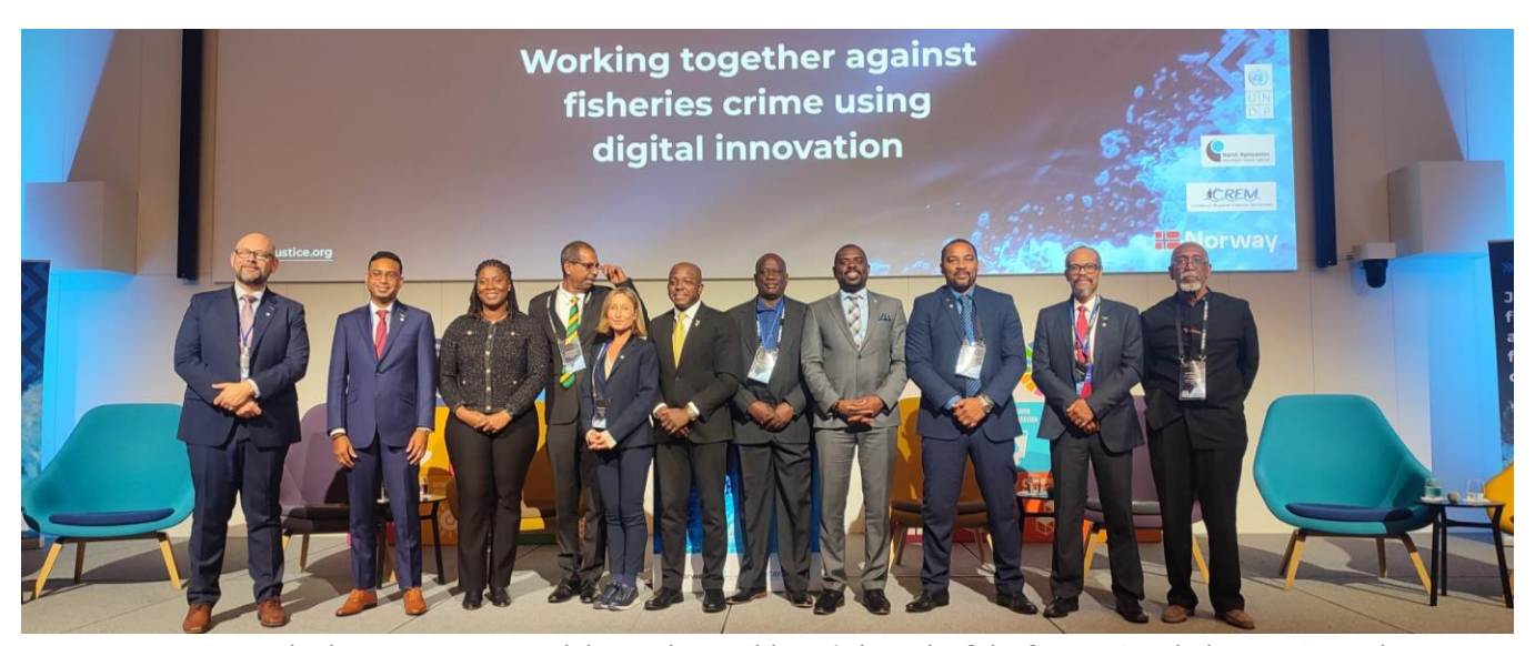
Jamaica and other CRFM States celebrate the Caribbean's launch of the first regional Blue Justice Hub

Belize City, Friday, 24 March 2023 (CRFM)—The Blue Justice Caribbean Hub, a regional hub to strengthen cooperation and coordination in the use of innovation and digital technology to fight fisheries crimes, was launched on the occasion of the two-day International Blue Justice Conference 2023, which concluded today in UN City, Copenhagen, Denmark. The establishment of the Blue Justice Caribbean Hub in Jamaica is the latest in a series of advancements by the Caribbean Regional Fisheries Mechanism (CRFM) and its Member States in combating illegal, unreported, and unregulated fishing and transnational organized crime in the fishing industry.