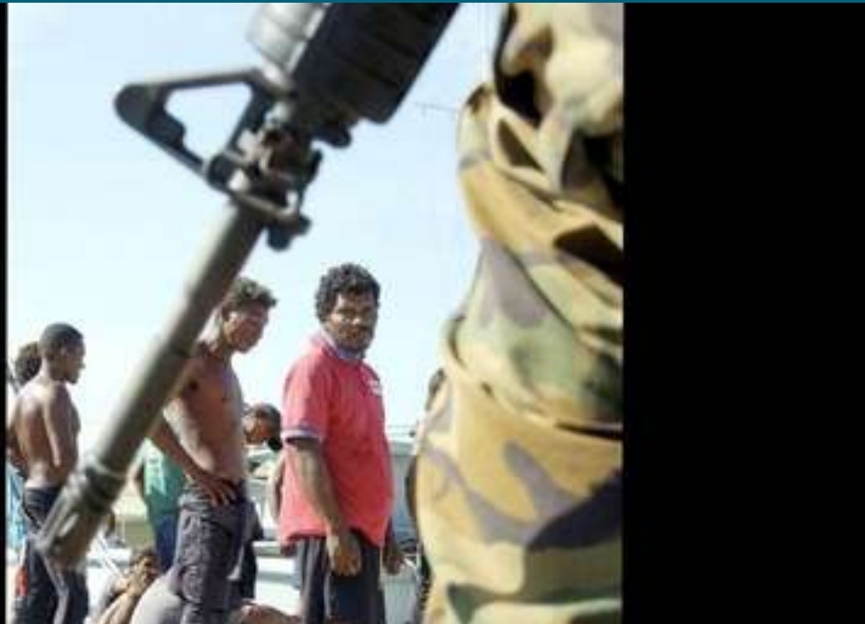
A Jamaica Defence Force soldier guards Honduran fishers who were fishing illegally for lobster and conch in Jamaican waters

The CRFM's Caribbean Fisheries Forum began work in 2006 that eventually led to the adoption of the Castries (St. Lucia) Declaration on Illegal Unreported and Unregulated (IUU) Fishing – speaks to a specific objective of the CCCFP